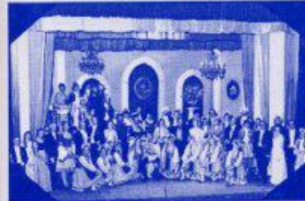
Merry Widow 1974