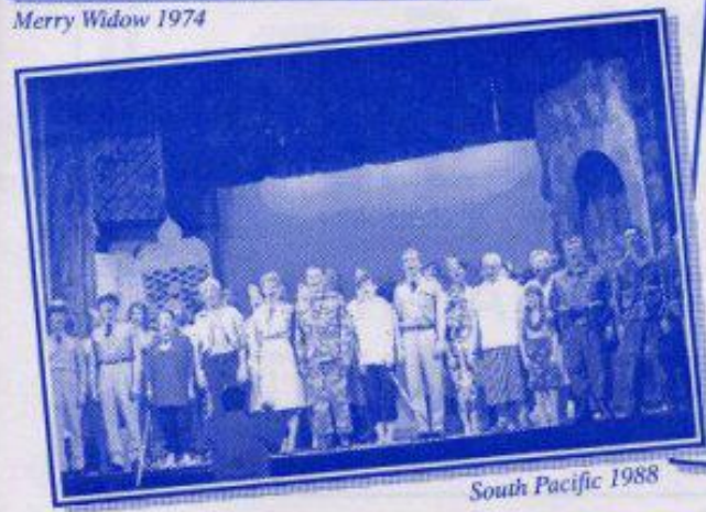
South Pacific 1988