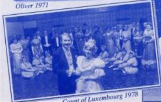
Count of Luxembourg 1978