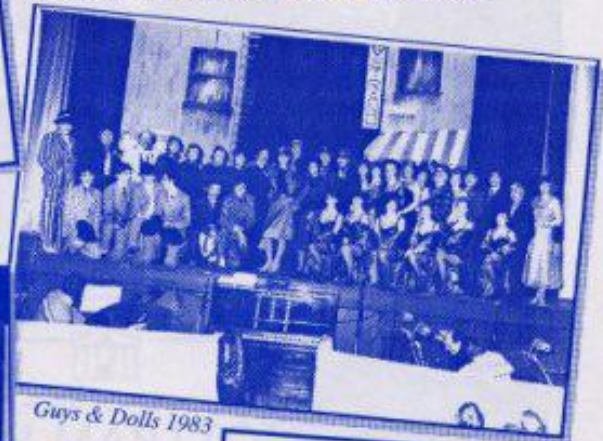
Guys & Dolls 1983