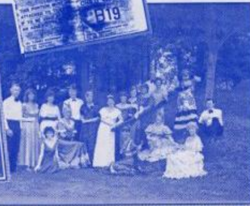
Die Fledermaus 1985

In 1985 the Theatre Group decided to take the plunge and produce a pantomime which was to be Dick Whittington, many successful pantos followed the majority being produced by our very own members. The Theatre Group continued to stage annual shows memorably 'Sweet Charity' which once again was taken to Waterford's festival.