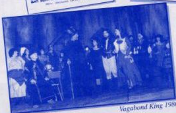
Vagabond King 1980