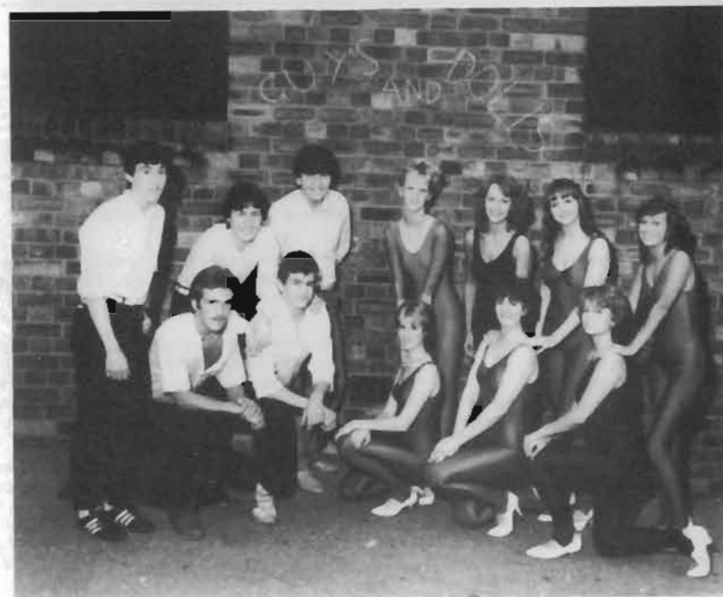
Boys & Girls