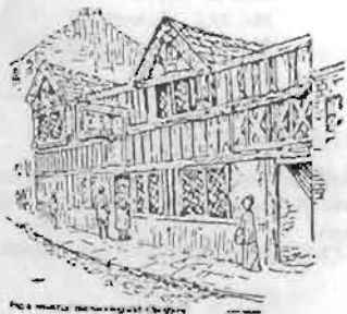
Old Pig & Whistle