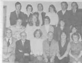
FRONT OF HOUSE & OTHER HELPERS