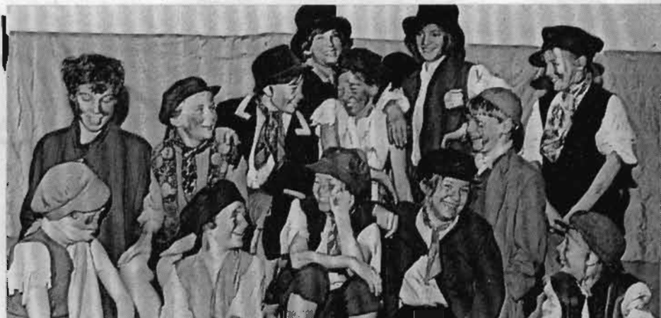
THE WORKHOUSE BOYS AND FAGIN'S GANG