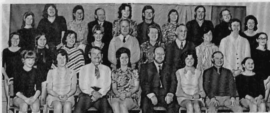
LADIES AND GENTLEMEN OF THE CHORUS AND THE DANCERS