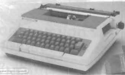
SCM. C. 420