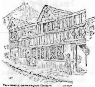
Old Pig & Whistle