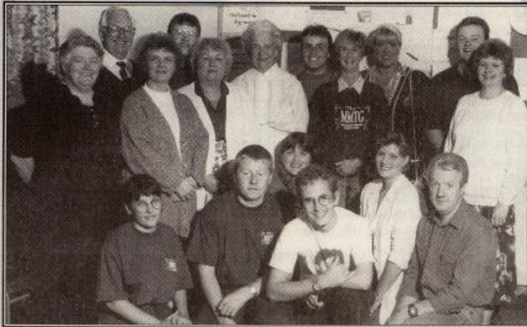
The Production Team