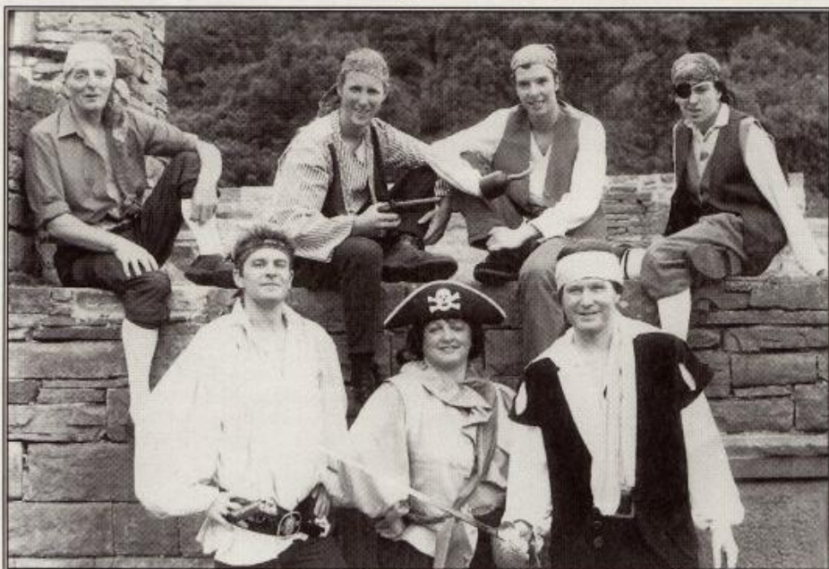
The Pirates of Penzance

All Advance bookings: Telephone 01625 611974