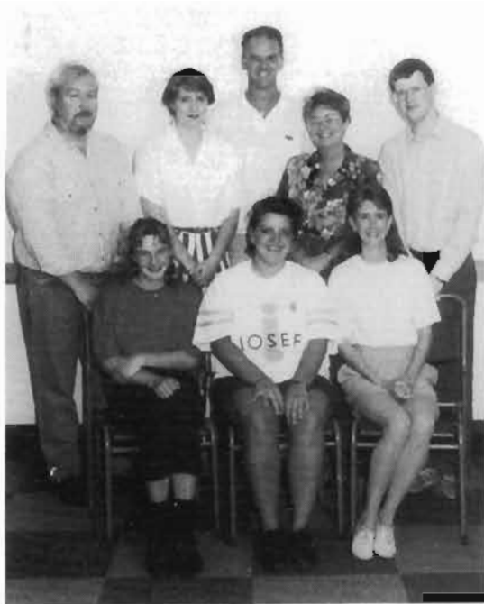
SOME OF THE STAGE STAFF (the others were too busy)