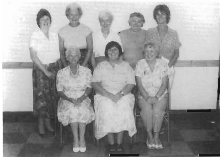
SOCIAL COMMITTEE and FRONT OF HOUSE