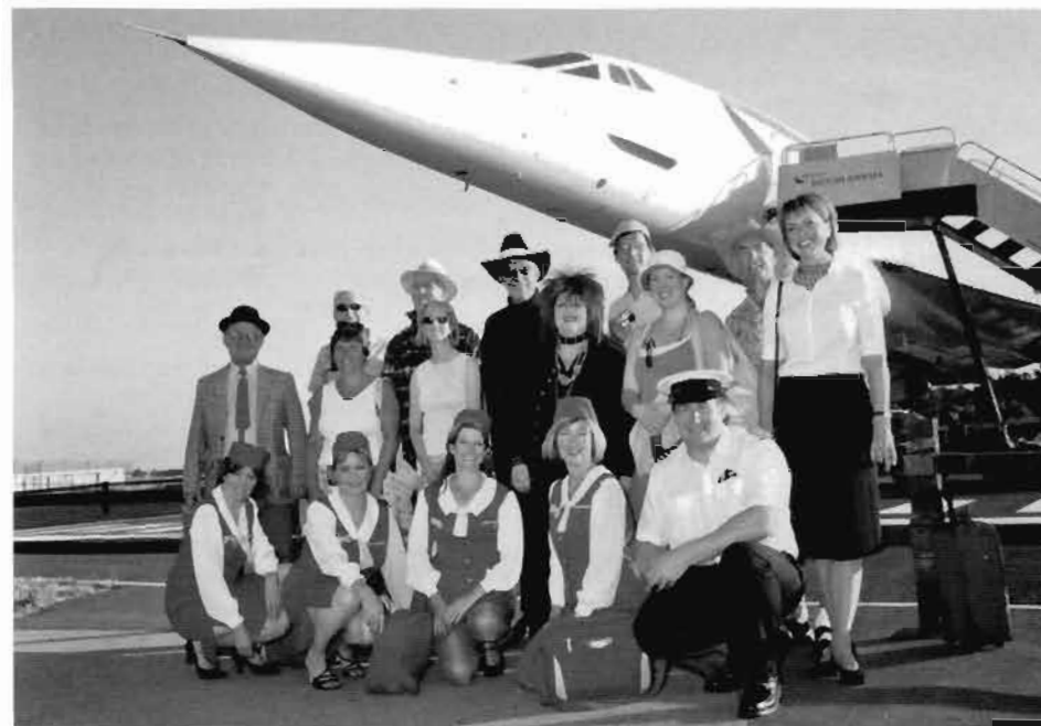
The Cast ready for Take Off