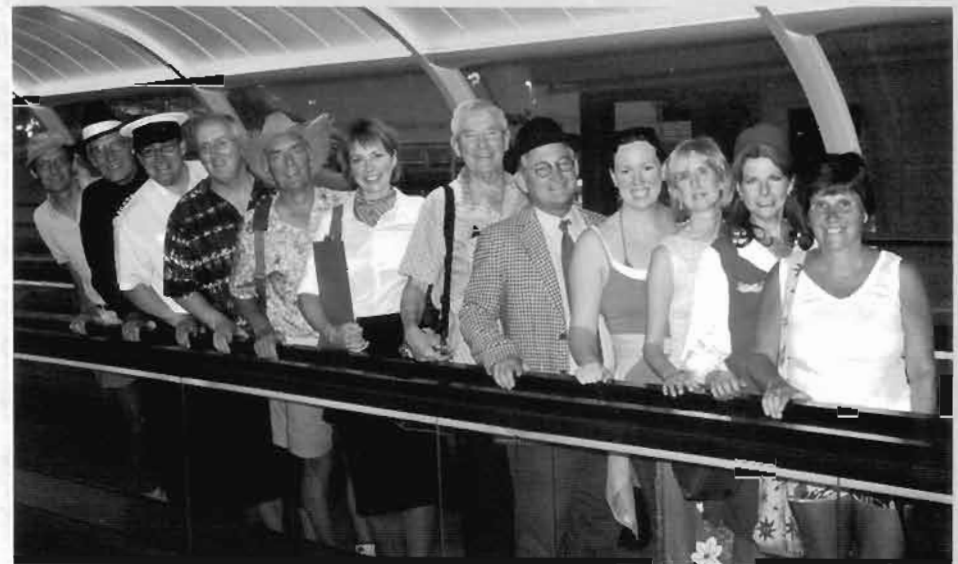
The Cast arriving at Titipu International Airport

Visit our Web-site: www.holdenandprescott.co.uk