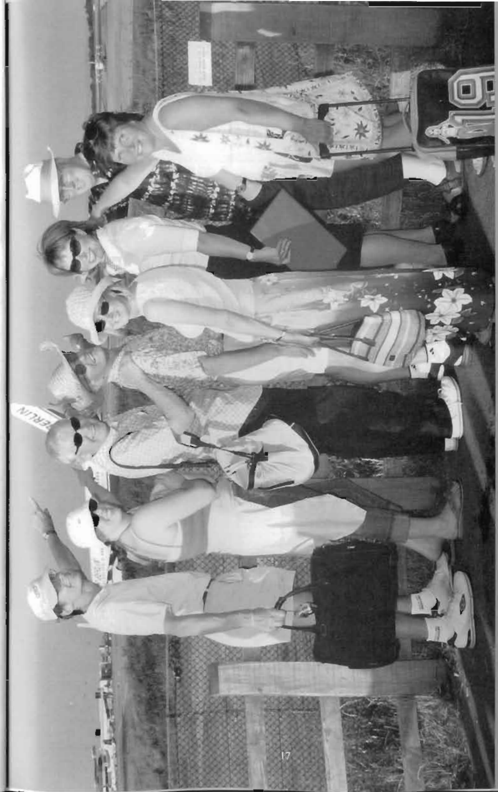
The Chorus

ANIMAL * BILLABONG * SALOMON QUIKSILVER * PROTEST * CHIMSEE ROXY * O'NEILL * NORTH FACE BURTON SPECIALIST DEALER