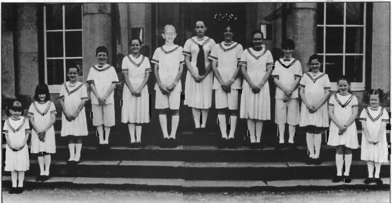
The von Trapp Children

63 Mill Street, Macclesfield - Tel: 01625 619195